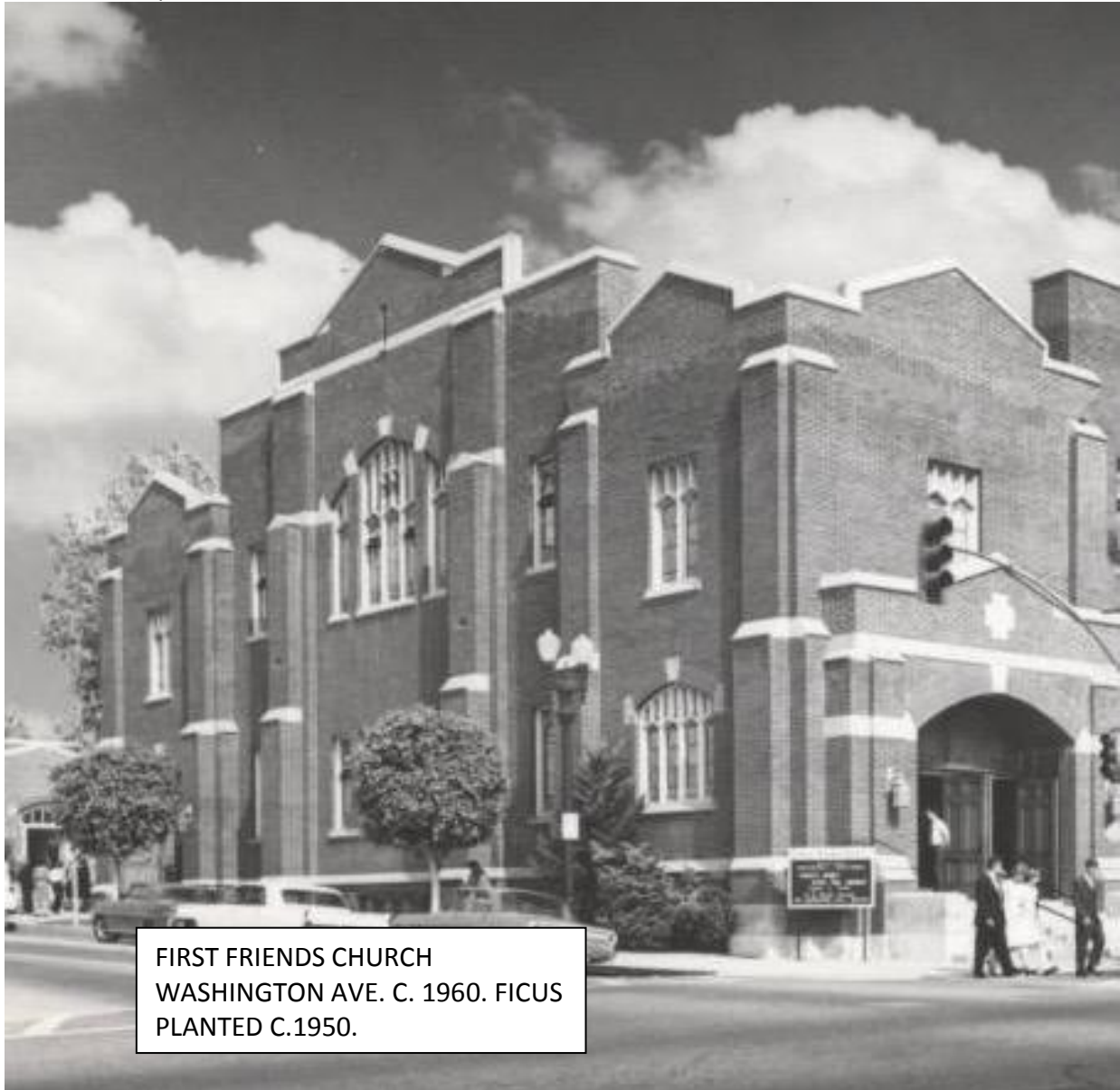
FIRST FRIENDS CHURCH WASHINGTON AVE. C. 1960. FICUS PLANTED C.1950.